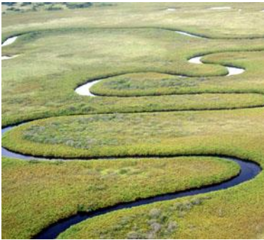
PS1: Assessment and Management of E&S Risks and Impacts