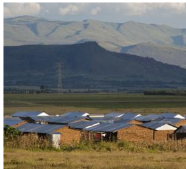
PS5: Land Acquisition and Involuntary Resettlement