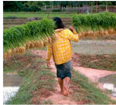
PS2: Labor and Working Conditions