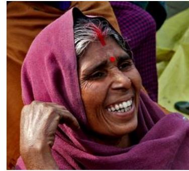
PS7: Indigenous Peoples