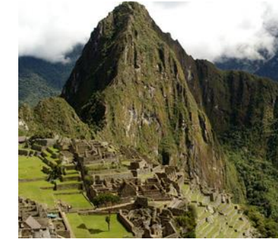
PS8: Cultural Heritage