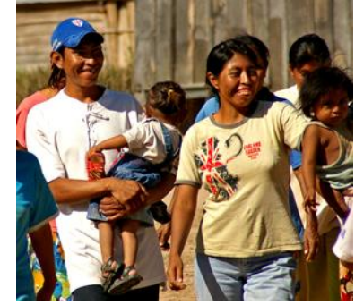
PS4: Community Health, Safety and Security