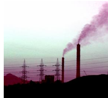
PS3: Resource Efficiency and Pollution Prevention