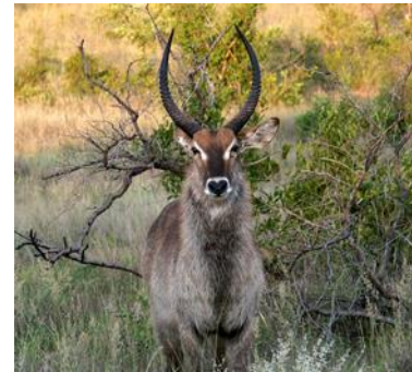
PS6: Biodiversity Conservation and Sustainable Management of Living Natural Resources