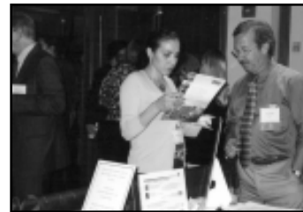
Exhibitors were on hand to discuss the latest tools, materials and publications.