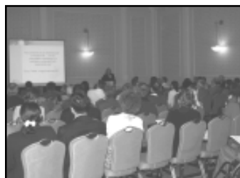
Concurrent sessions drew large numbers of attendees.