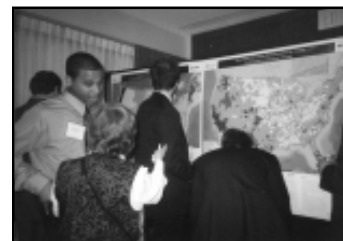
Serious discussion at the poster session.