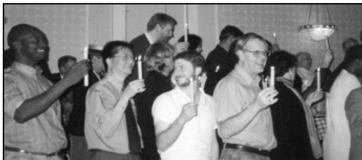
Lighting the way: IAIA's 25th birthday celebration.