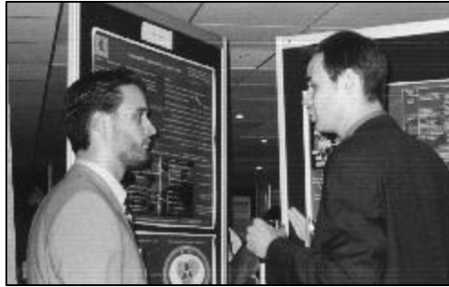
Serious discussion at the poster session

"IAIA meetings are getting better and better!"