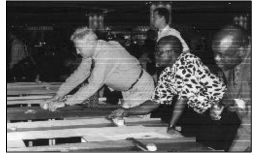
Serious fun at the post-poster party, "Wednesday Night Fever"