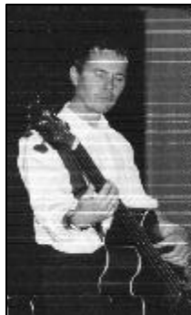
Can you identify this rock star? See answer below.