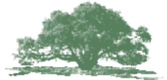
IAIA'03: 14—20 June 2003