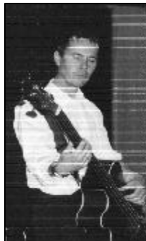
Can you identify this rock star? See answer below.