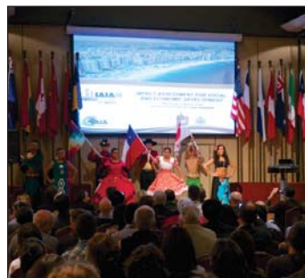
Local dancers entertain the crowd at the start of the IAIA14 closing plenary.