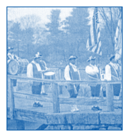
Patriots Day

This special one-day program is being co-sponsored by the American Bar Association's Section of Environment, Energy & Resources, the nation's leading organization of environmental lawyers, in partnership with the other co-sponsors and the International Association of Impact Assessment, the largest international association of its kind, on the occasion of the 25<sup>th</sup> Anniversary of IAIA.