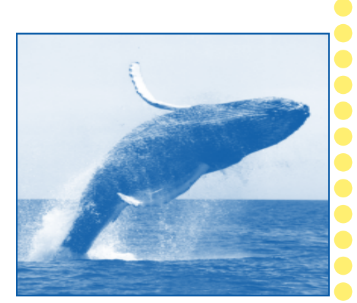
Jumping whale.