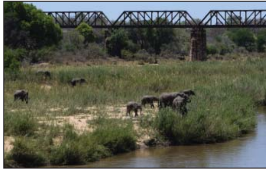
(L) Symposium delegates in a session. (R) Elephants in Kruger National Park.

IAIA thanks these sponsors, whose generous contributions helped to make the 2014 Resettlement & Livelihoods Symposium a success: