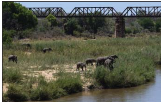
(L) Symposium delegates in a session. (R) Elephants in Kruger National Park.

IAIA thanks these sponsors, whose generous contributions helped to make the 2014 Resettlement & Livelihoods Symposium a success: