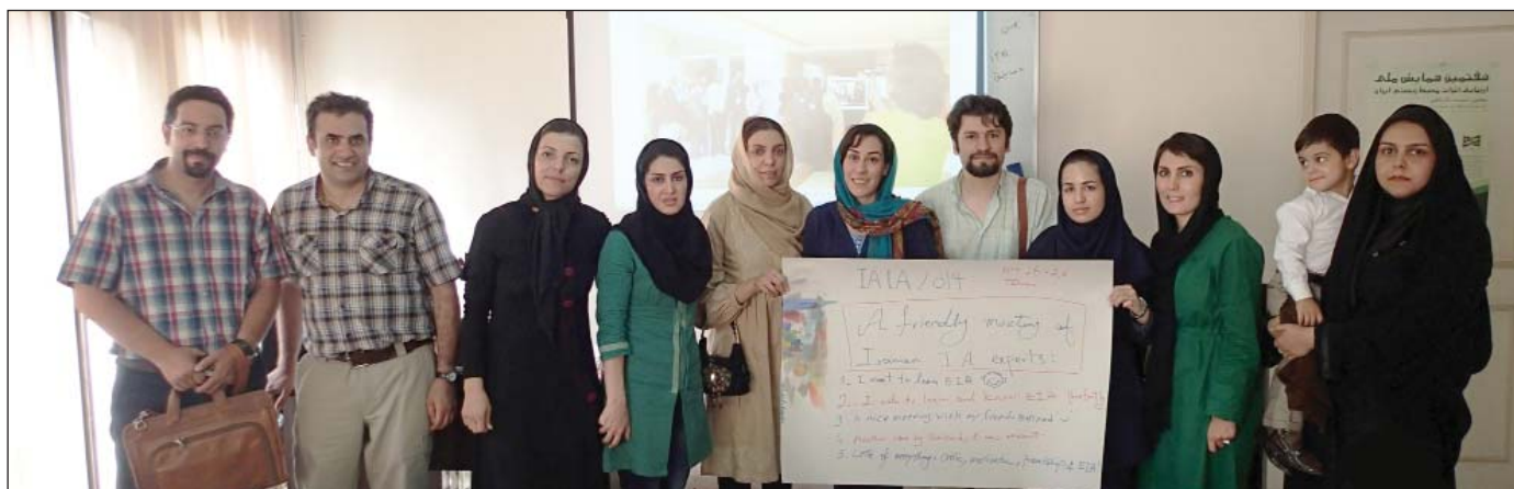
IA practitioners in Iran discuss IAIA14 and the role of IAEA at a recent information sharing session.

■ BEHZAD RAISSIYAN • BEHZAD@RAISSIYAN.COM