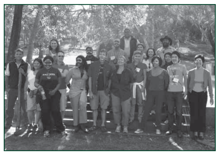
Participants in the Aboriginal Culture Experience technical visit.

People from different nations and countries dance the "djitti djitti" together with face painting; can you imagine that? Thanks to IAIA08 for giving us such an opportunity to experience aboriginal culture together.