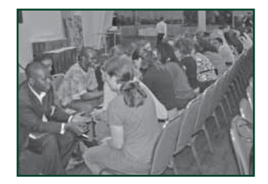
Over 700 delegates attended IAIA08. How many did you meet? Quite a few—and many you might not have met otherwise—if you participated in "Speed Networking."